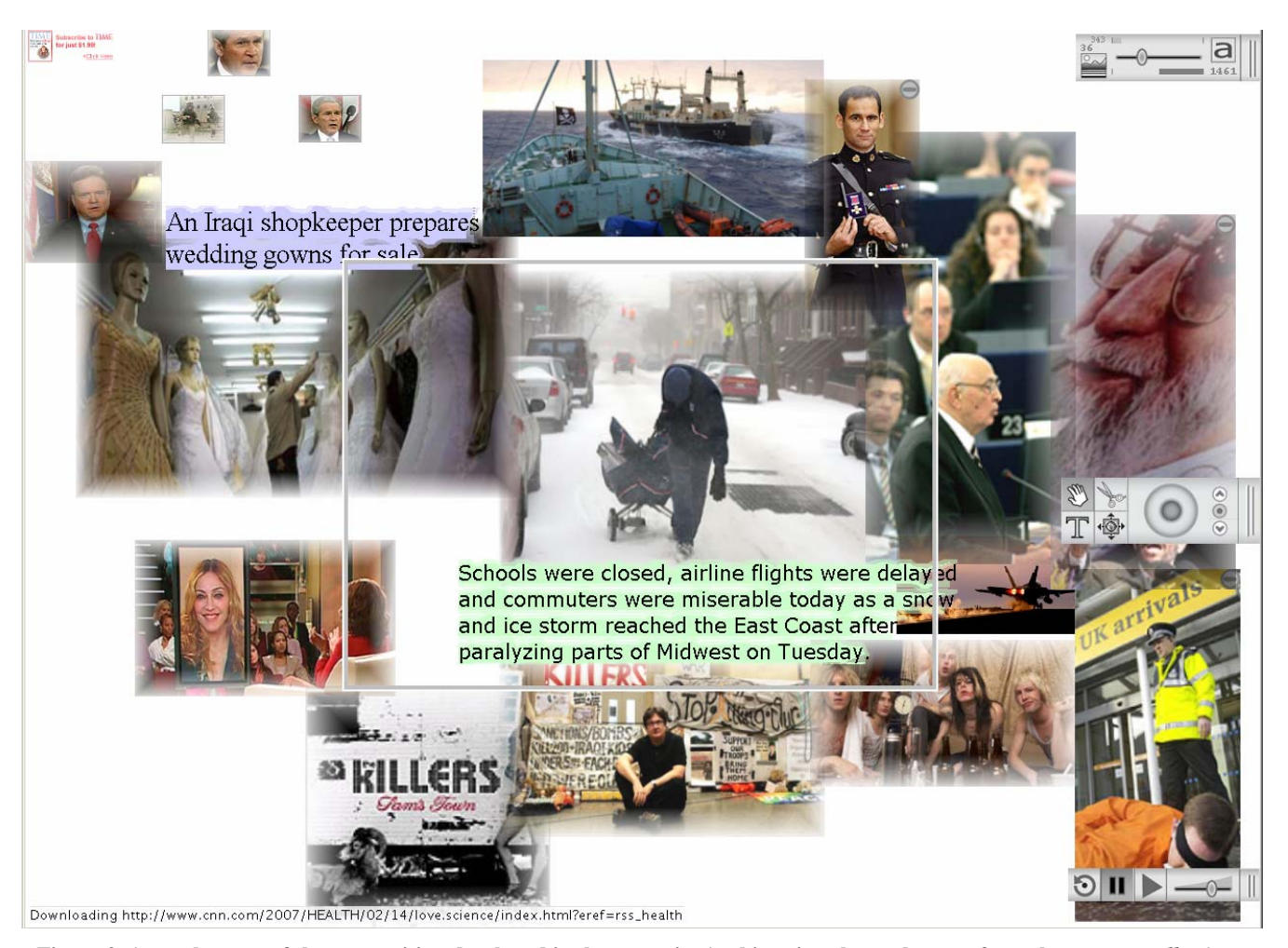
Figure 2. An early stage of the composition developed in the scenario. At this point, the seeds come from the news re:collection.

thinking about information [4, 5]. Digital information functions to support creative idea generation. By mixed-initiative, we mean that generative agents work in partnership with a human participant to collect relevant information, and represent the collection in the form a visual composition that changes over time. Images and text engage complementary cognitive subsystems. Each collection of information resources is represented as a connected whole. This promotes information discovery, the emergence of new ideas in the context of information.